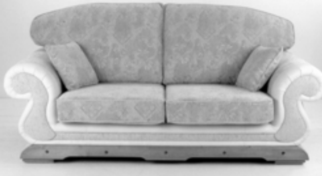
Pic top r corner: Highgrove's Carrington sofa and pictured here their Osprey suite design.